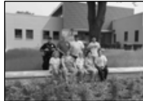
Perennial Garden at Midtown