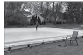
Ice Rink at Sunset Park