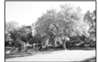
Adopting the ash tree that guards the Lucia Crest playground