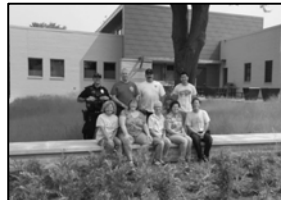
Perennial Garden at Midtown