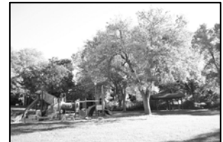
Adopting the ash tree that guards the Lucia Crest playground