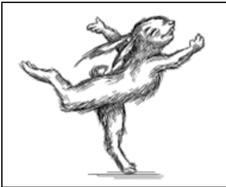
2023 The Chinese Year of the Rabbit

Monday, January 30 , 7:00-8:30 p.m. Sequoia Library or via Zoom: Zoom Meeting Link: https://cuwaa.zoom.us/j/91242996181 Meeting ID: 912 4299 6181