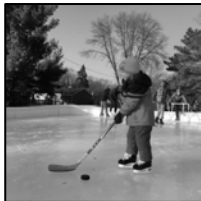
Ice Rink at Sunset Park