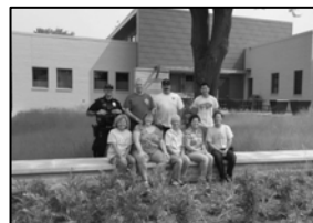
Perennial Garden at Midtown