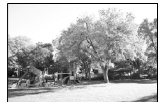
Adopting the ash tree that guards the Lucia Crest playground