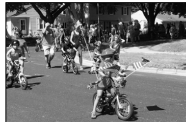
Westmorland July 4th Celebration