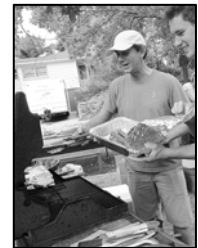
Hillside Terrace Block Party